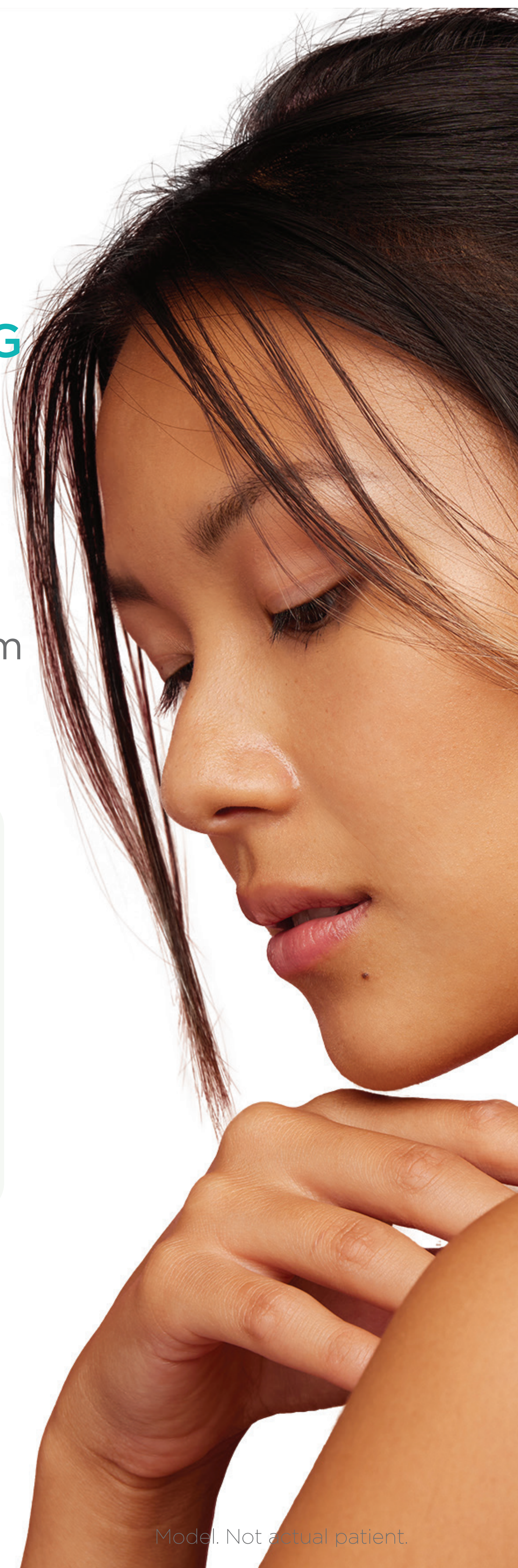
Model. Not actual patient.